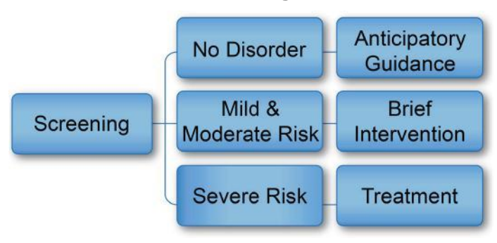
Exhibit 1: Screening to Treatment

Some schools, especially those with nurses or social workers, provide routine substance use screening. Because trained clinicians must conduct screenings, many community agencies or volunteer groups do not have the capacity to provide full substance use screenings. It is more common for schools or other community agencies to provide substance use prevention education and support.